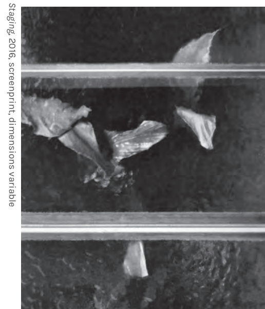
Staging, 2016, screenprint, dimensions variable

Eurich cites Russian Formalist Victor Shklovsky as an influence, in particular his articulation of the idea that art makes the familiar strange, and requires the viewer to work through this strangeness through a prolonged act of looking. By only showing one image, but presenting it multiple times, Eurich alludes to the ease with which we gloss over images that confront us in day to day life—they may as well be all the same. Interestingly, for all its repetition, the image itself is perhaps the least important element of this work, bearing little of the exegetic weight of the work. Rather, it is the subject matter of the image that is percipient. Eurich's imagery often focuses on subjects/substances that are emblematic of the dichotomies brought up by this exhibition—pooling water, or the glass housing of a greenhouse. In black and white, somewhat pixelated form, they illustrate the dual qualities of water and glass: both have surfaces that can reflect what is in front of or above them and obscure what's beneath or beyond the surface, or alternately provide a clear lens through to another space. What is called to mind are the potentially antithetical characteristics of surface versus depth, embodied here in the form of the image and